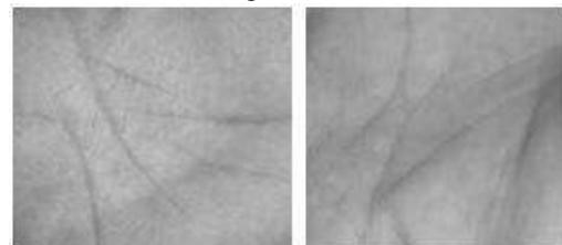
Figure 2: Palmprint ROI images of IITD and CASIA

Region of Interest comprises of the rich palmprint image textural information, using the method described in the part-III is used to extract the ROI from all of the four databases, then normalized to a size of 128x128 pixels. The results are shown in Figure-2.