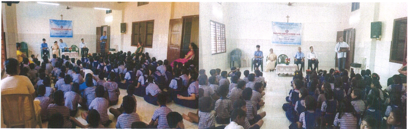
Figure: Valedictory function.