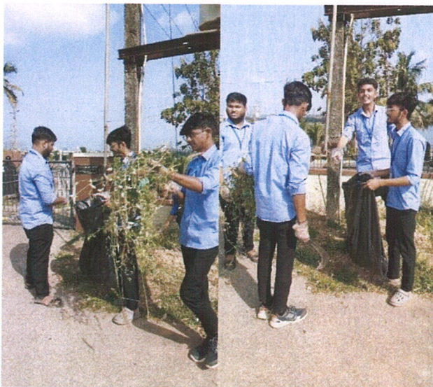
Figure: Street cleaning.