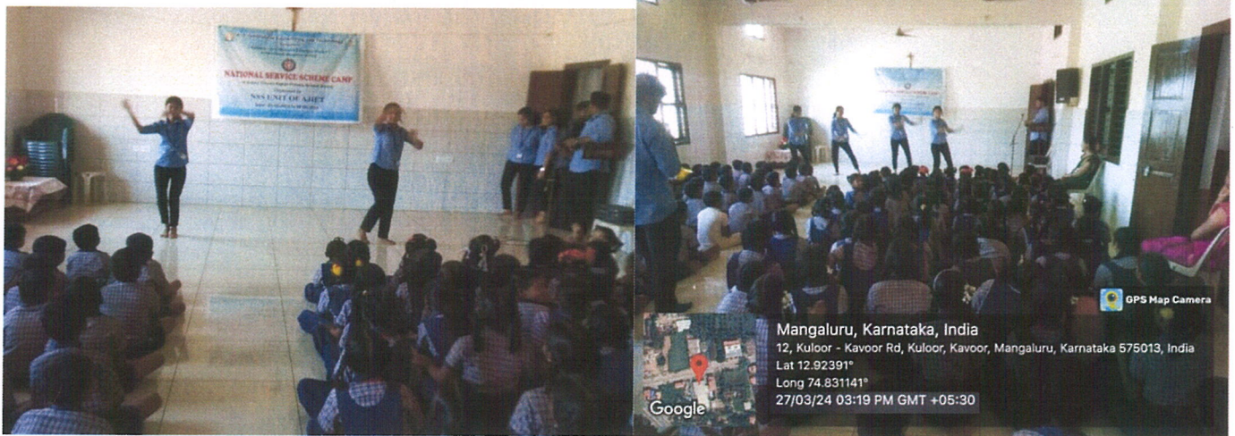
Figure: Cultural Program.

(Accredited By NBA (BE : CV, CSE, ECE, ISE & ME))