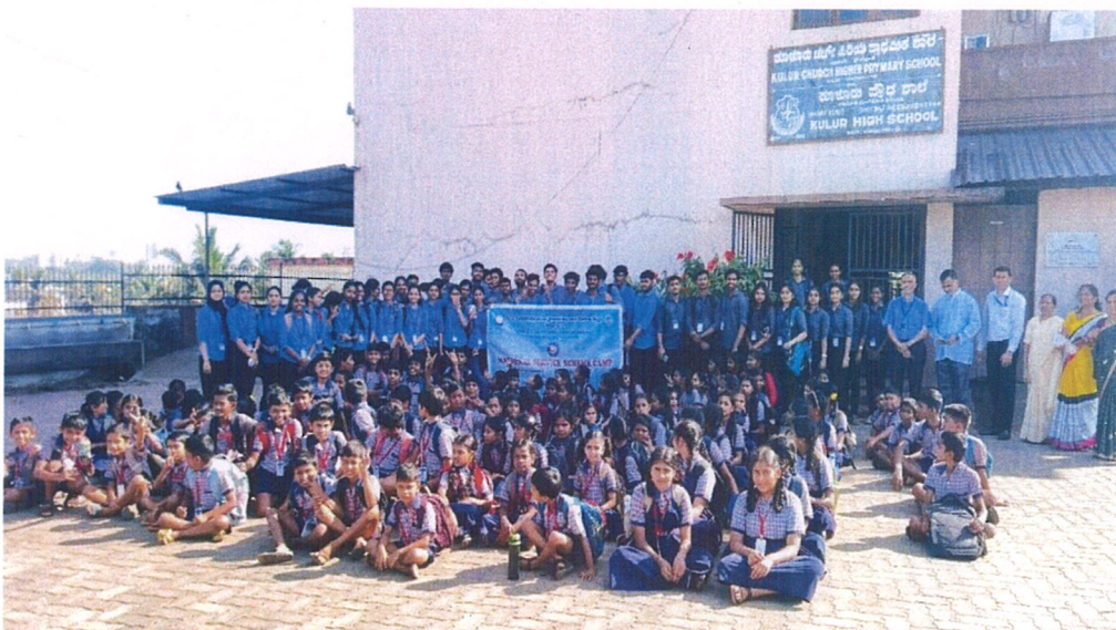
Figure: Group photo .

Principal A.J. Institute of Engineering & Technology Mangaluru - 575006