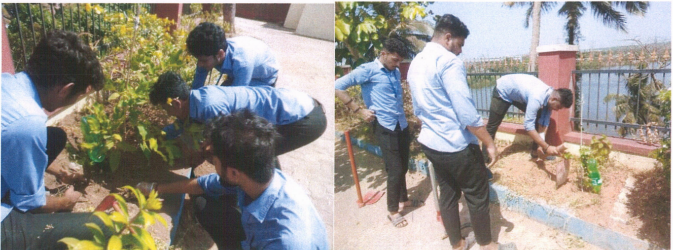
Figure: School garden cleaning.

Fourth days (24/03/2024) camp begins with Yogic exercise from 6.45am to 7.45am and which is followed by breakfast. Around 9 am. Volunteers begins the camp with shibira geethe gayana then they started the school garden cleaning and gardening work in and around the school. Also they added new variety of flower and fruit bearing plant sapling. Volunteers with great interest worked on water irrigation system by introducing water spraying units to the garden. After the lunch break volunteers participated in the swacchhatha abhiyana in and around the school and church premises.