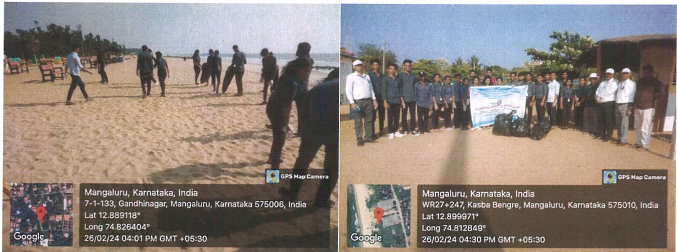
Figure: Beach cleaning at Thannirbhavi.

the local area shramadana/beach cleaning activities. Since Thannirbhavi beach is besides the kuluru church school we opted the some area of Thannirbhavi beach for cleaning. Volunteers actively participated in the beach cleaning activity and collected eight bags of waste from the beach.