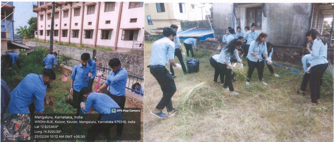
Figure: Shramadaan at school ground.

Third days (23.0.2024) camp begins with Yoga exercises from 6.45am to 7.45am and which is followed by breakfast. NSS volunteers are continued shramadana at school ground from 9.00am to 11.00am and cleared the entire school ground. School ground is ready to play for school children's. After the tea break, from 11.00 to 11.30am volunteers involved in the class room activities. Volunteers taught the cleanliness, sign board and road safety etc. After the lunch from volunteers took test from 2PM to 3 PM. Afternoon session volunteers attended the talk personal development. Fr Vector Vijay Lobo conducted the session from 3.00 4.30 PM.