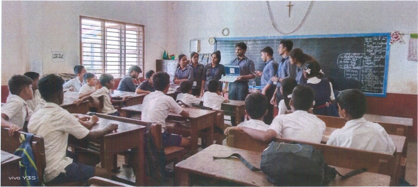
Figure: Shibira geethe gayana.

(Accredited By NBA (BE : CV, CSE, ECE, ISE & ME))