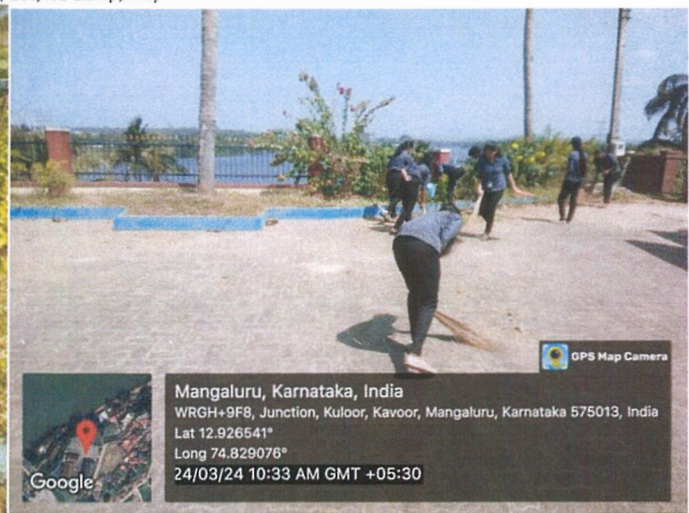
Figure: Gardening work and cleaning.

Fifth days (25/03/2024) camp begins with Yogic exercise from 7.00am to 7.45am, followed by breakfast. Around 9.00 AM all volunteers moved to the local area visit in around the kulur and kottara. The main intention of this visit is to enlighten/ create the awareness on swachhatha abhiyan/cleanliness, effect of electronic gadgets on human health etc. In spite of the heavy sunlight volunteers took the task to spread the awareness to the local area people. All the volunteers were gathered back in the school premises at around 4pm. After the tea snacks volunteers took rest