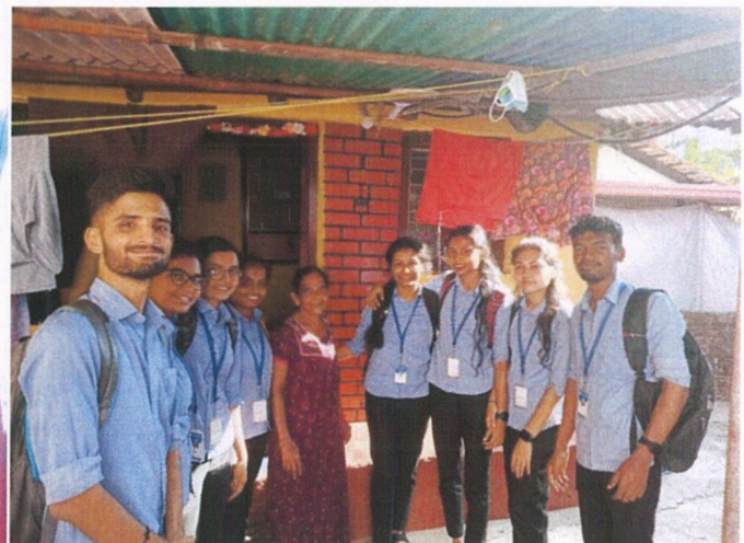
Figure: Enlightening awareness on cleanliness and effect of electronic gadgets on human health.

On the sixth day (26/03/2024) after the breakfast, volunteers moved to the classes to interact with school children's. This time they taught some of the pencil sketch drawing, paper art activities and and games activities to the children's. It was amazing to see the great response from the children for these activities. These activities were continued up to 12.30pm. In the afternoon session some of the volunteers moved to