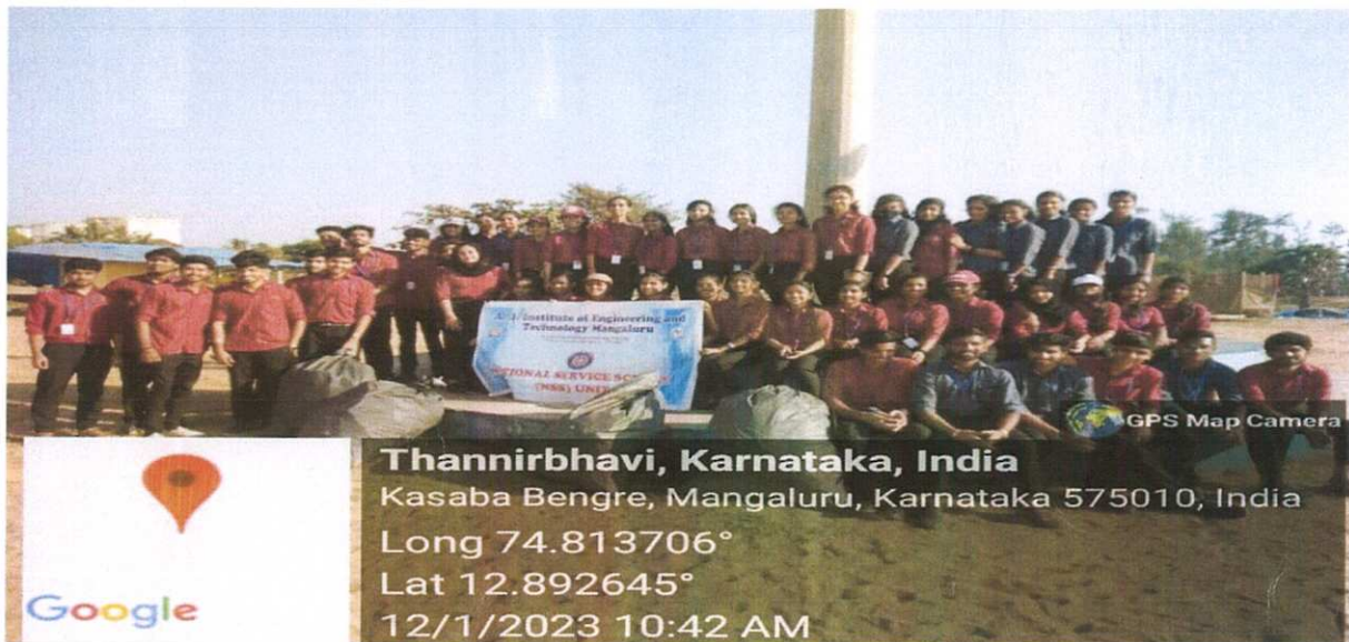
Figure: Group photo of NSS volunteers with waste collected during swachhata abhiyan at Thanniru Bavi beach.

The NSS unit of AJIET, comprising volunteers from the Computer Science & Engineering and Civil Engineering departments, organized a "Beach Cleaning" Abhiyan at Thannirbhavi Beach on Friday, January 12, 2023. The objective was not only to ensure a beautiful coastline but also to help maintain a healthy marine ecosystem.