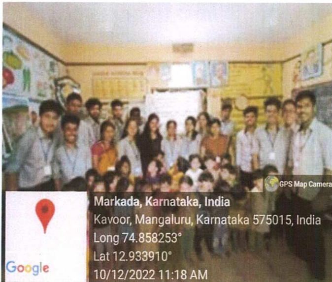
Figure: Group photo with School children's.