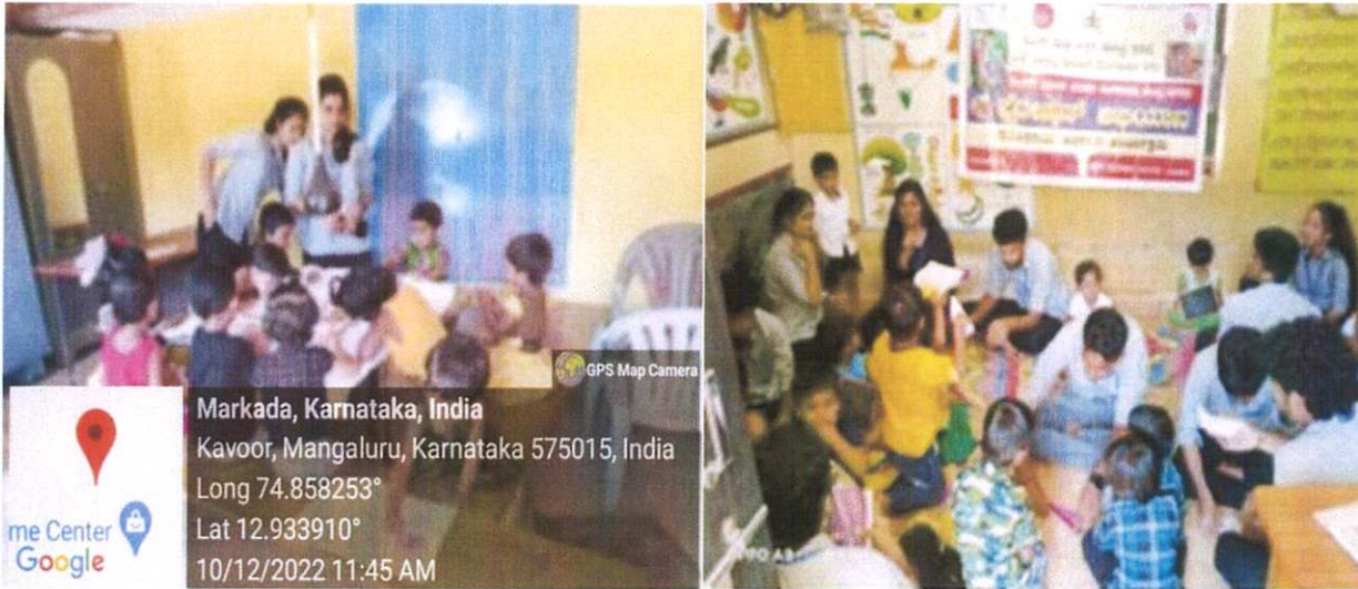
Figure: Interactive session with School children's.