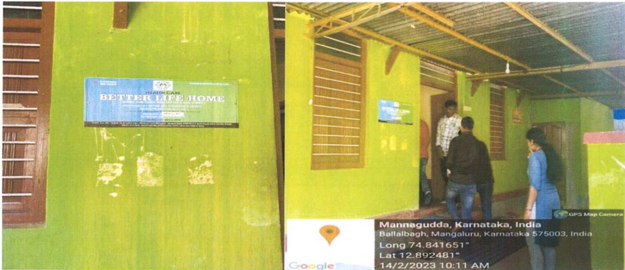
Figure: Visit to Old Age Home Mannagudda , Mangaluru.

(Approved by AICTE, New Delhi, Affiliated to Visvesvaraya Technological University, Belgavi)