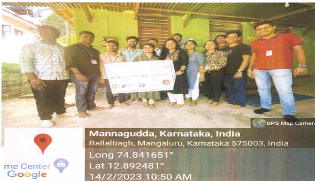
Figure: Group photo at Old Age Home Mannagudda , Mangaluru.