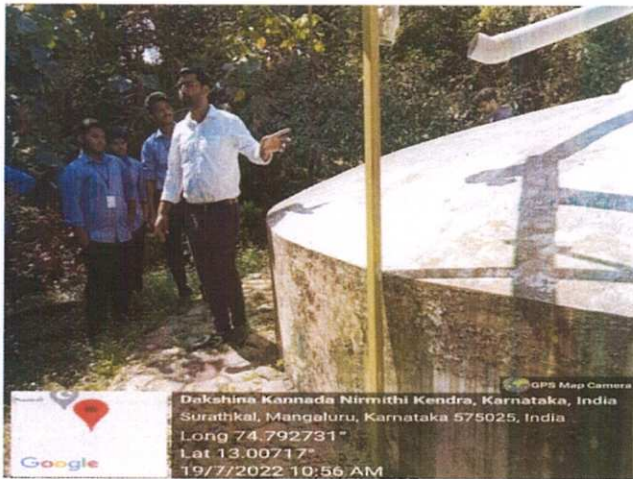
Figure: Informative session by expert near water reservoir.