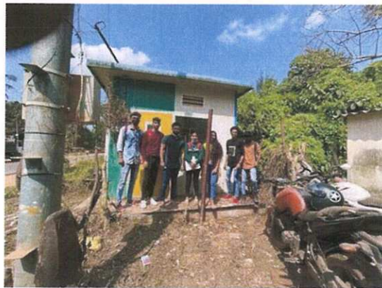
Fig: Inspection of RO Plant, Malavooru

According to users R O Plant is not in working condition. The quality of drinking water is good. Source of water is other. There is proper power supply to the water plant and is running 12 hrs in a day. People from this habitation depends on this water plant..