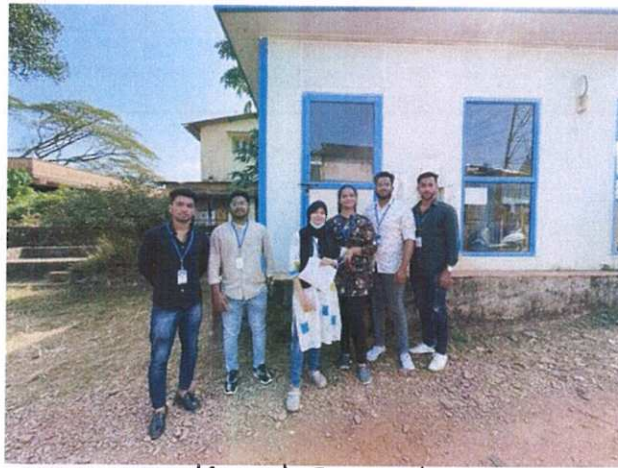
Fig: Inspection at Ro, Plant , Bajpe.

According to users R O Plant is not in working condition. The quality of drinking water is good. Source of water is bore well. There is proper power supply to the water plant and presently it is running 12 hrs in a day. People from this habitation depends on this water plant. Water tank is not clean.