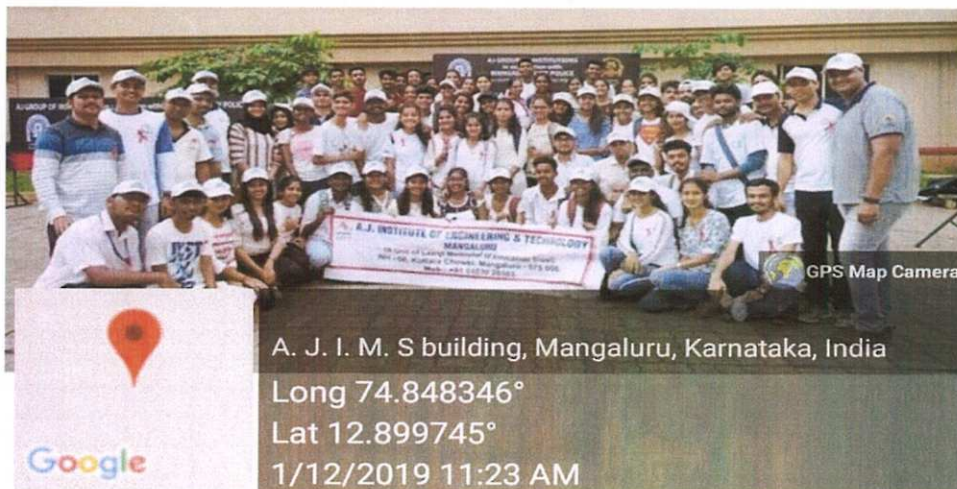
Figure: Group photo of the Students who participated in AIDS awareness programme at AJIMS Kuntikan.

The volunteers were enthusiastic and dedicated, marching through the streets while chanting impactful slogans designed to catch the attention of passersby and communicate vital information about AIDS. Their voices resonated with a clear message: understanding and preventing AIDS is crucial for the well-being of the community.