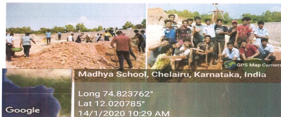
Figure: NSS volunteers setting up the playground for the students of Primary Madhya School.

The volunteers dedicated themselves to the task, working diligently to transform the playground into a safe and enjoyable space for the children. Their efforts included clearing debris, leveling the ground, and installing basic play equipment. By the end of the day, the playground was thoroughly prepared and ready for the children to use, providing them with a space to play and engage in physical activities.