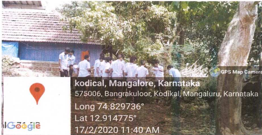
Figure: NSS Volunteers involved in cleaning activity at Kodical School

(Approved by AICTE, New Delhi, Affiliated to Visvesvaraya Technological University, Belgavi)