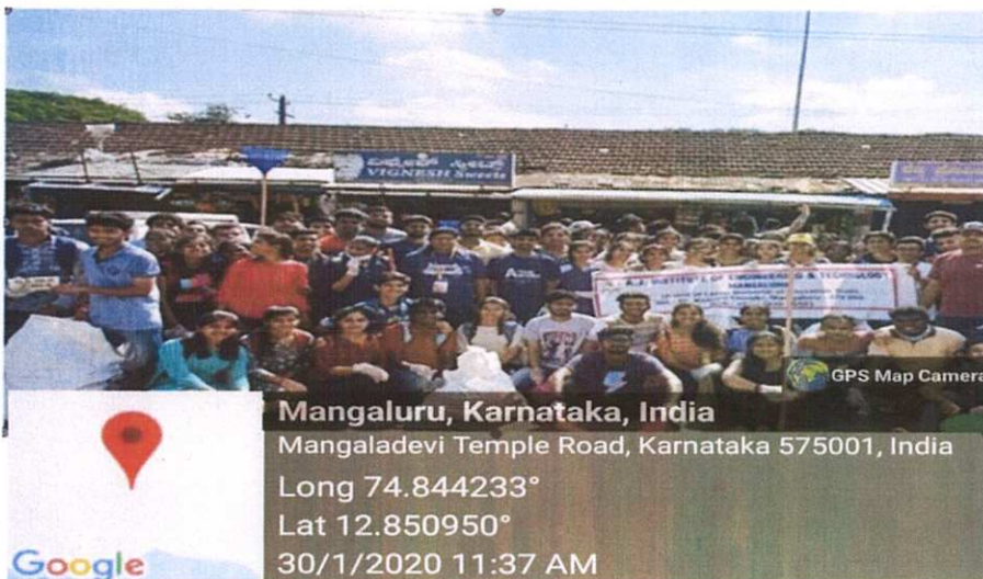
Figure: Group photo during Swachh Bharath Abhiyan Phase 5.