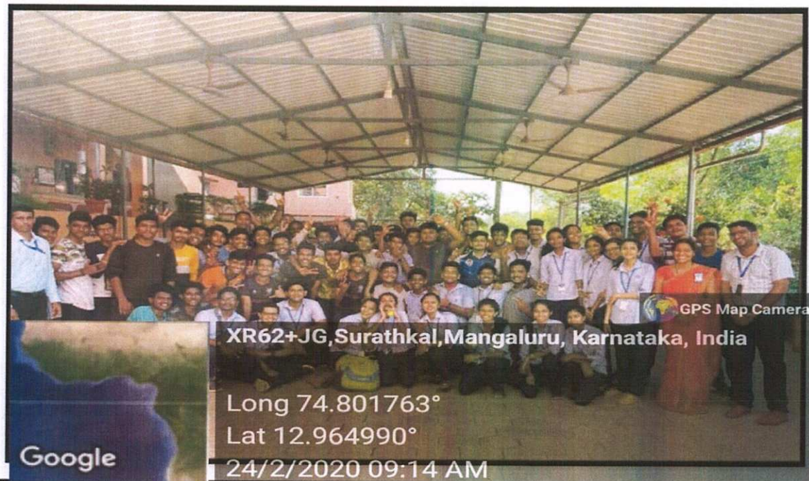
Figure: Group photo at Surathkal Government Primary school.