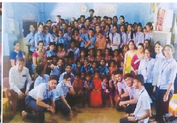
Fig: Group Photo.