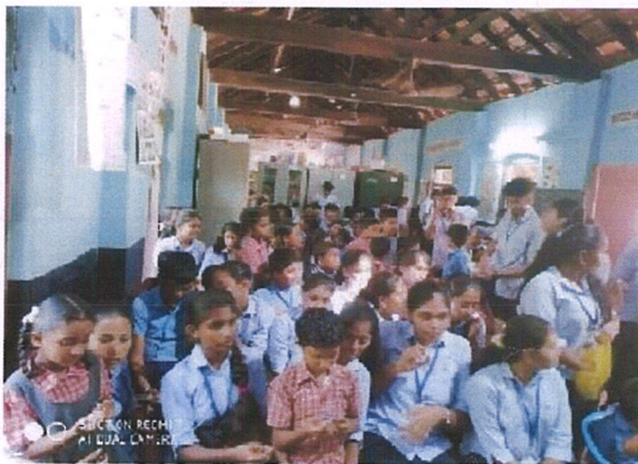
Fig: Interaction with School Children.