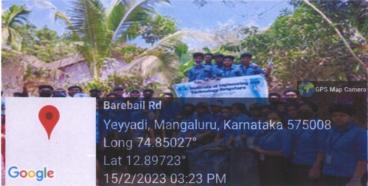
Figure: Group Photo.

third for naturally decomposable materials. The filled plastic bags were then gathered at the end of the street and packed properly. The Mangalore City Corporation was informed to collect these bags for further processing.