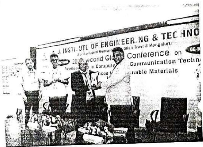
Glimpse of Issuing Token of Gratitude