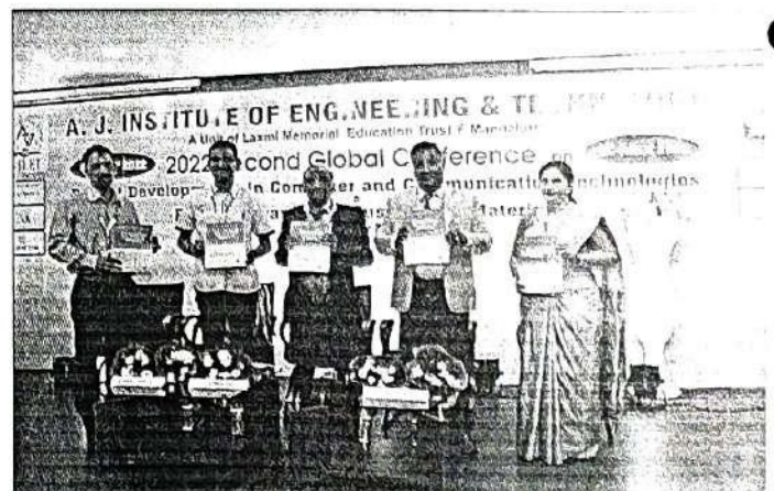
Glimpse of Inauguration of the Conference

Principal A. J. Institute of Engineering & Technology Mangalore - 575 006