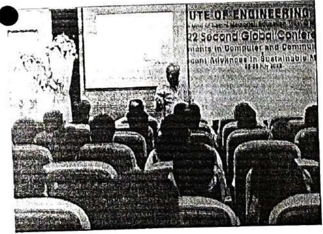
Glimpse of Keynote Session