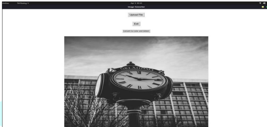
The selected image by the user will be displayed on to the interface.

The analysis of results of the proposed framework. Result is one of the last and important phases in the project development. It explains how the project works and its results. In our project we are detecting whether the news is real or fake. Here are some of the snapshots of the working project.