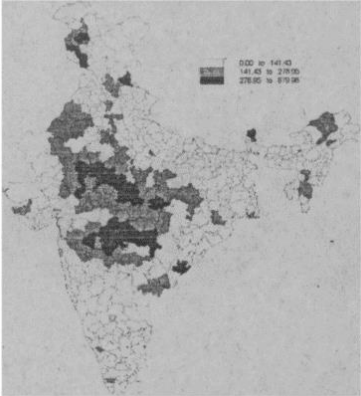
Figure 2: Crime against Women