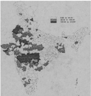
Figure 3: Cruelty at Home