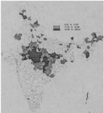
Figure 4: Rape