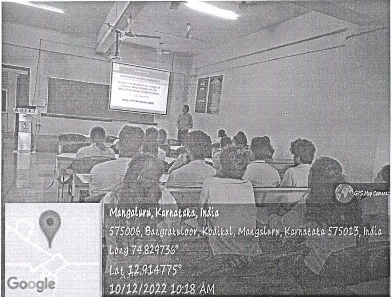
Hands on Session on usage of Virtual Meet Platforms for Effective Team Collaboration