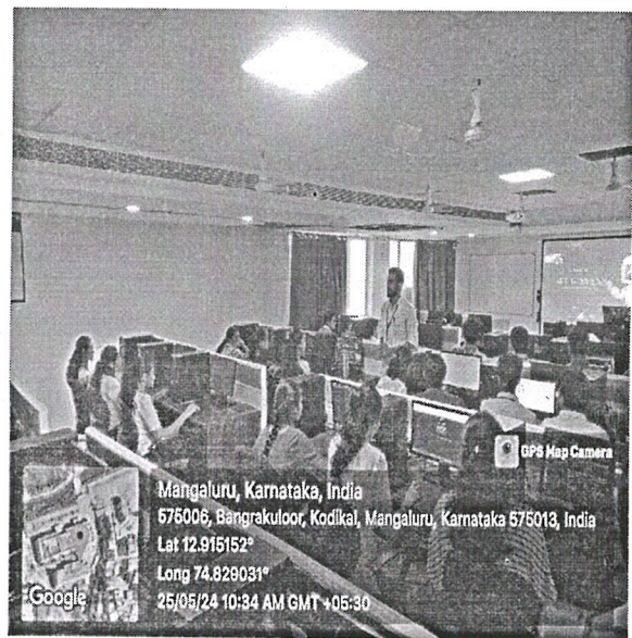
Workshop on web Technology on 25/05/2024