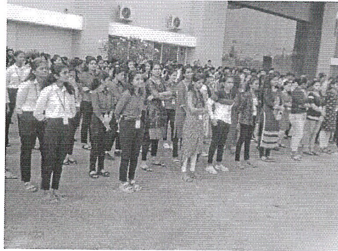
Walkathon by National Service Scheme

(Approved by AICTE, New Delhi. Affiliated to Visveswaraya Technological University, Belagavi)