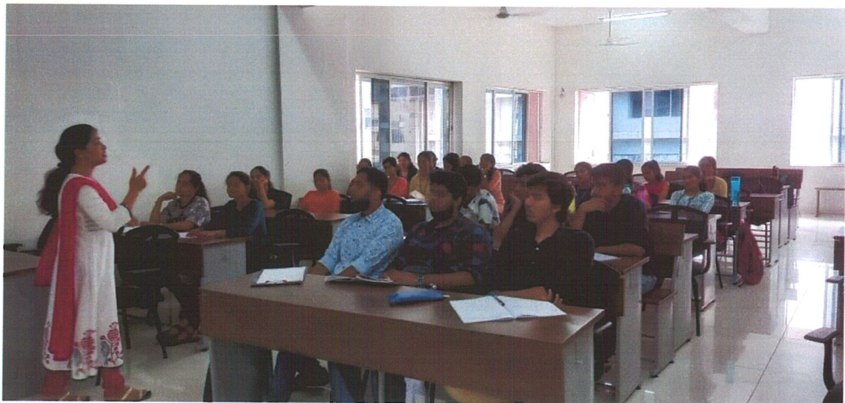
Fig: Team member is handling the session.