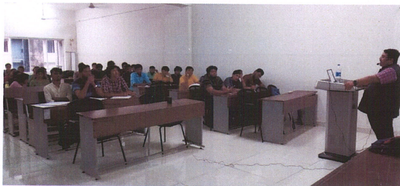
Fig: Team member is handling the session.