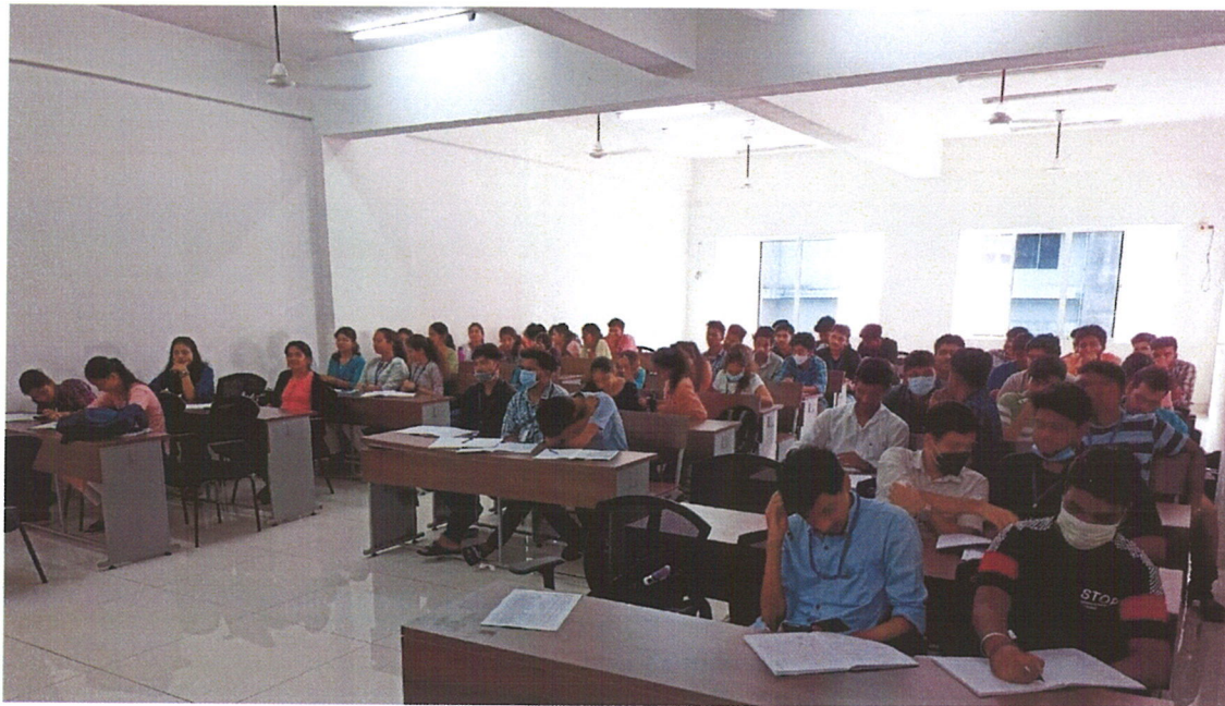
Fig: Team member from JV Global is handling the session.