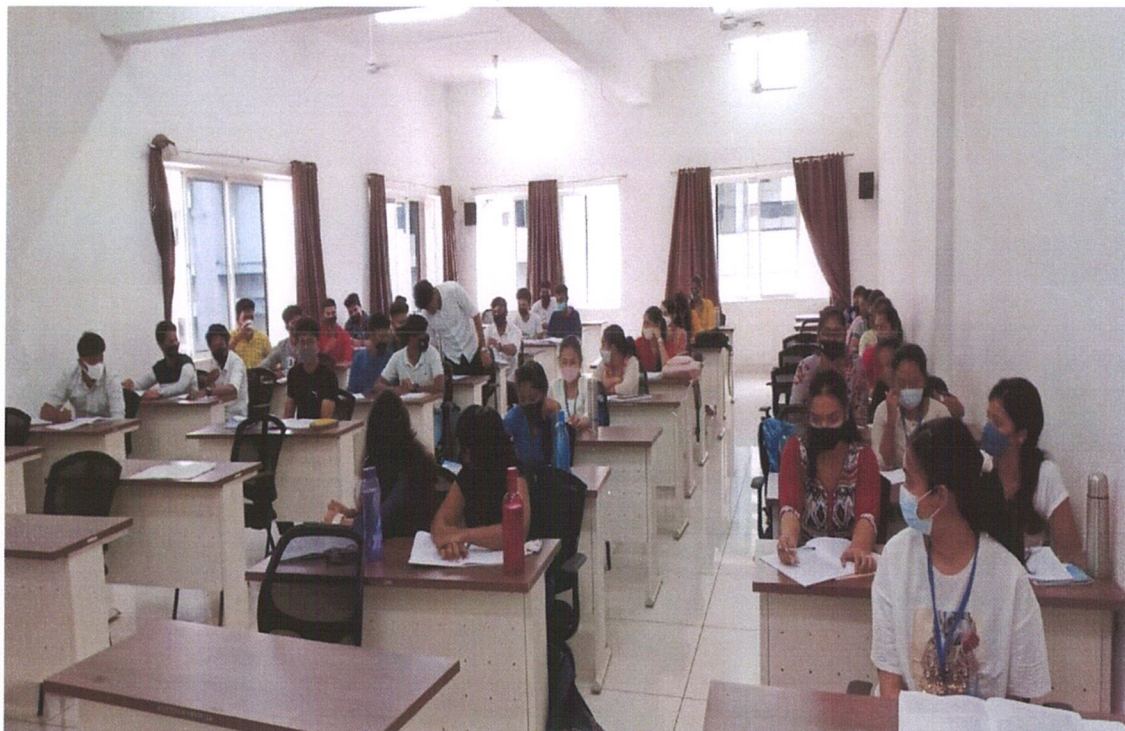
Fig: Team member handling the sessions.