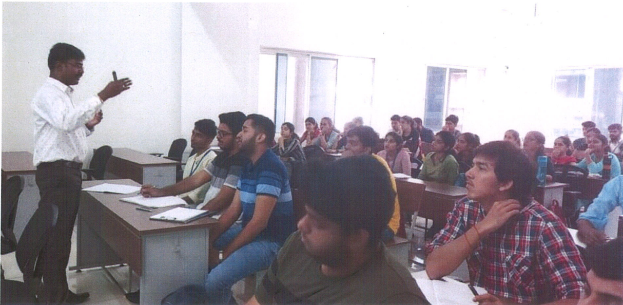
Fig: Team member handling the sessions.