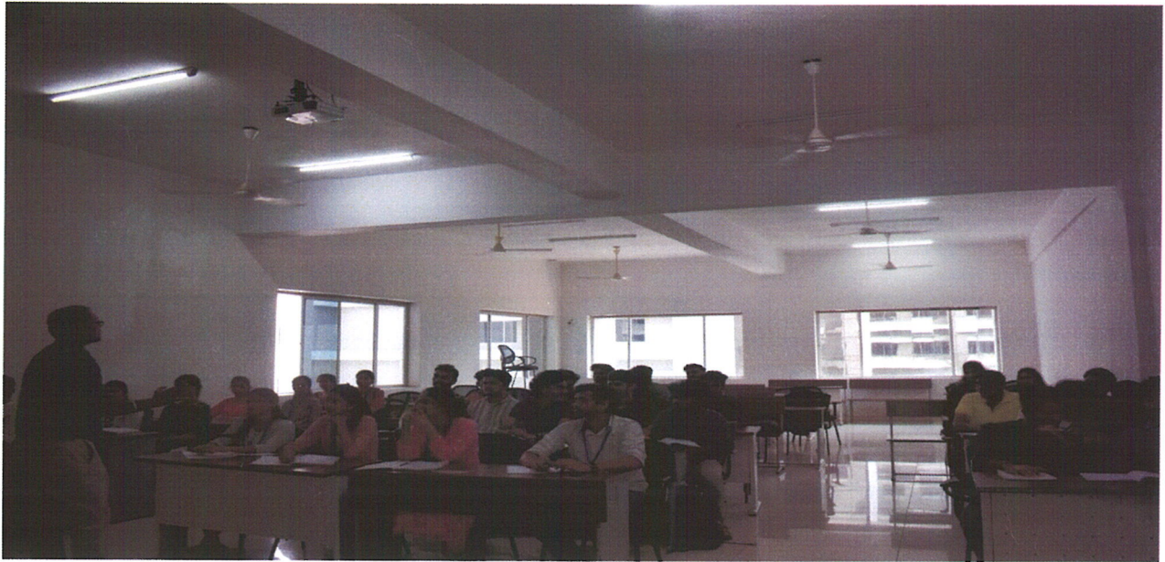
Fig. Team member is delivering the sessions.

(Approved by AICTE, New Delhi. Affiliated to Visveswaraya Technological University, Belagavi)