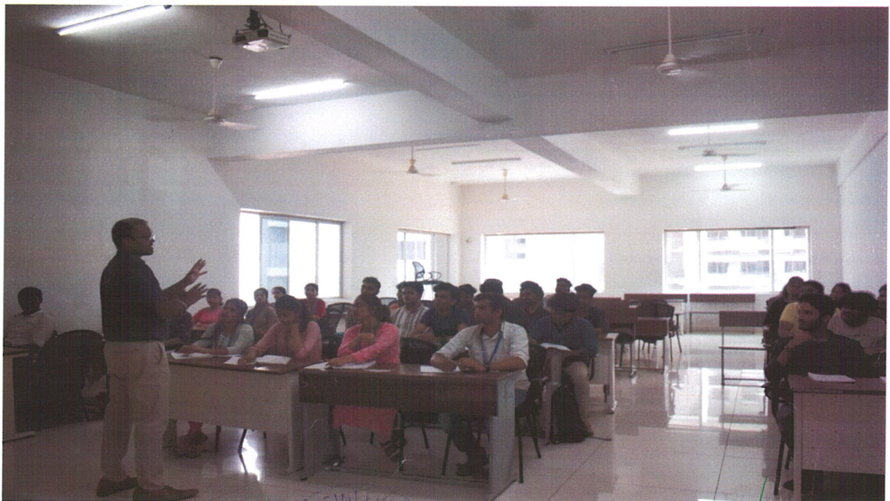
Fig. Team member is delivering the sessions.