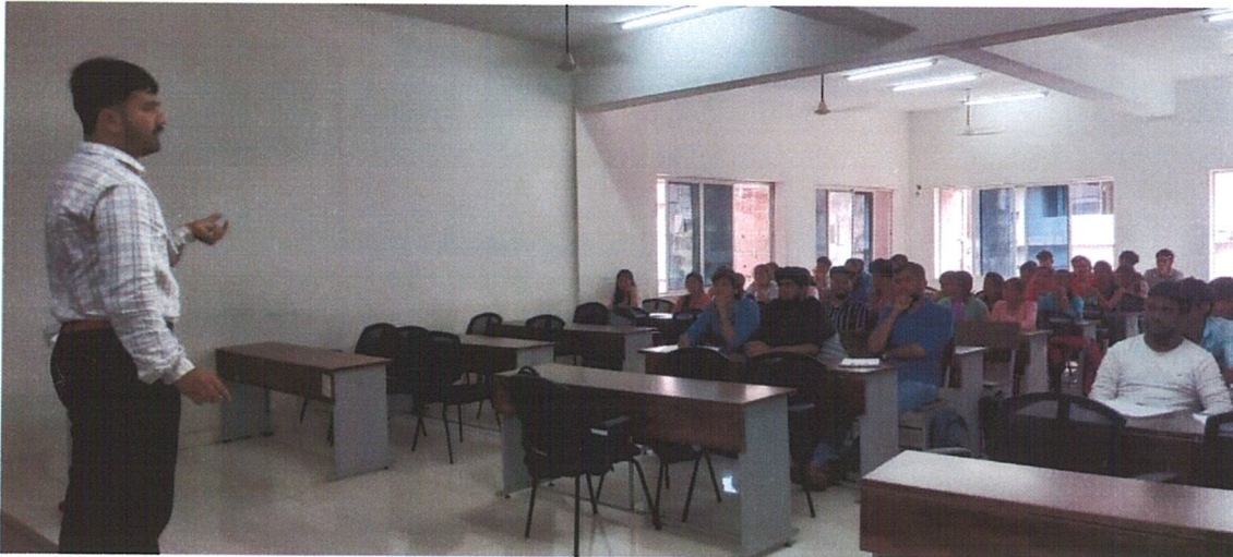
Fig: Member from 10 Seconds Handling the session