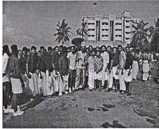
Fig: Programme Photos