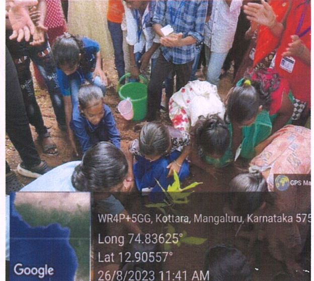
Planting sapling in school ground