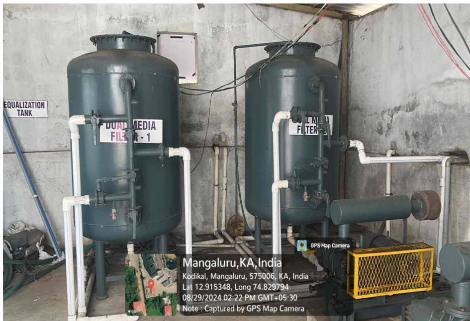
Equalizer Tanks inside Sewage Treatment Plant