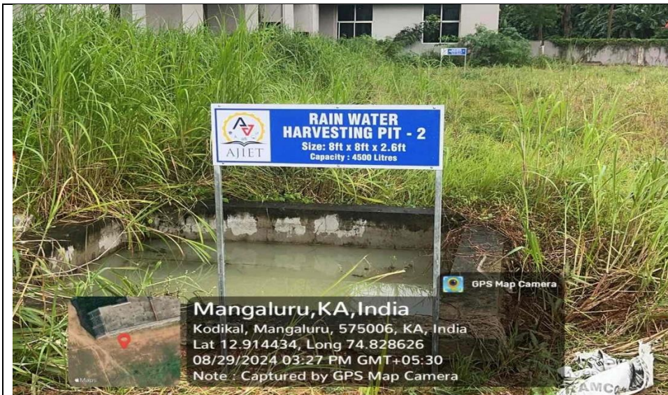
Rain Water Harvesting Pits

Accredited by NBA (BE: CV, CSE, ECE, ISE, ME)