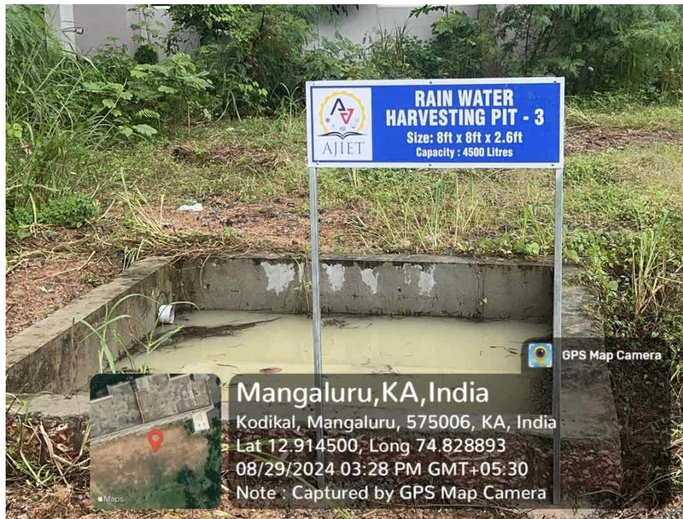
Rain Water Harvesting Pits