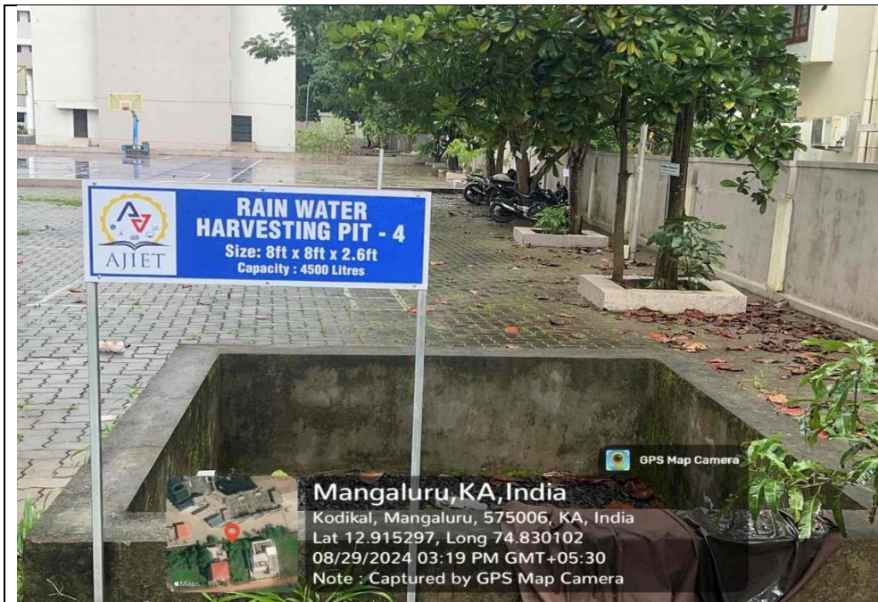
Rain Water Harvesting Pits

Accredited by NBA (BE: CV, CSE, ECE, ISE, ME)