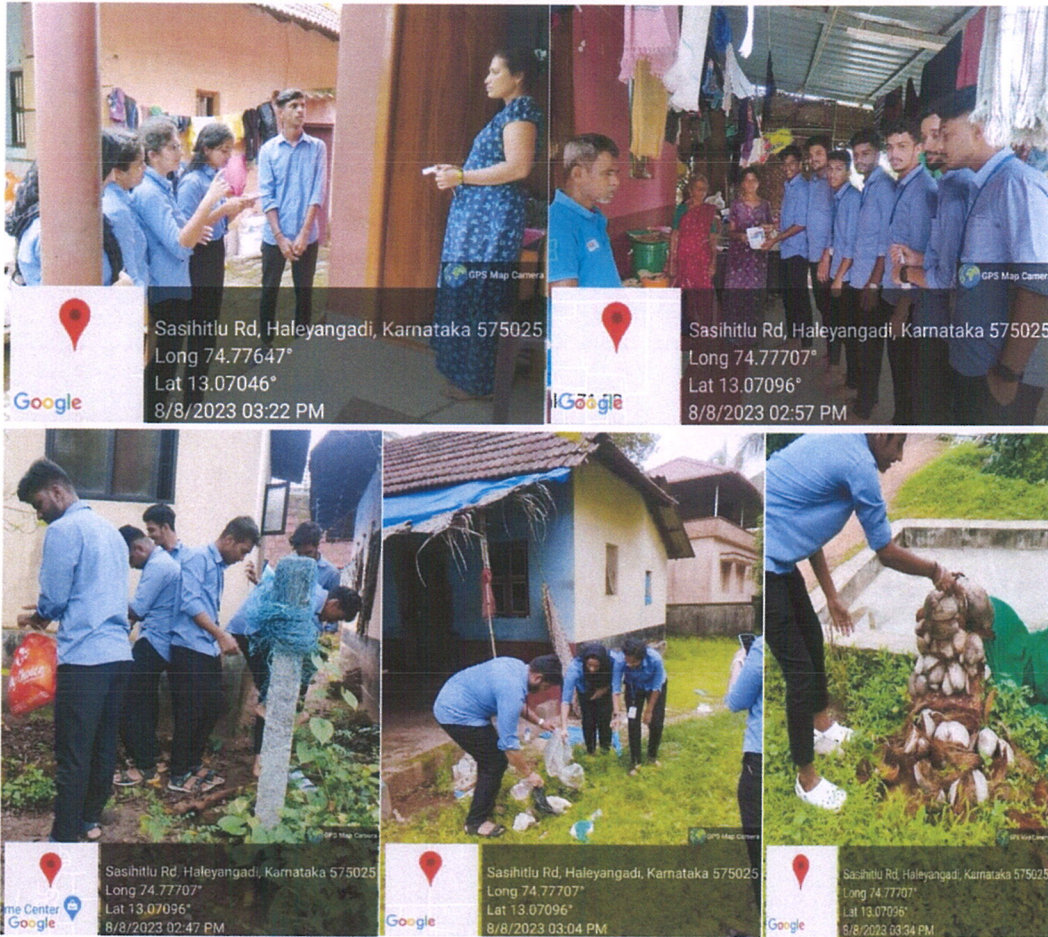
Students creating awareness about spread of Malaria-Dengue and inspecting the surrounding of the home.

(Approved by AICTE, New Delhi, Affiliated to Visvesvaraya Technological University, Belgaavi)