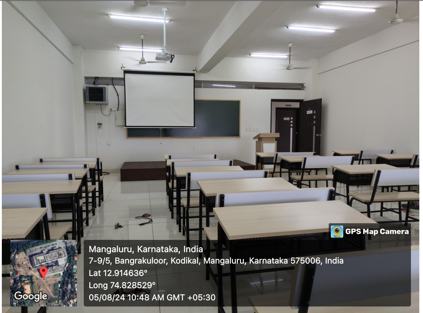
A-311: Inner View

Mangaluru, Karnataka, India 7-9/5, Bangrakuloor, Kodikal, Mangaluru, Karnataka 575006, India Lat 12.914636° Long 74.828529° 05/08/24 10:48 AM GMT +05:30