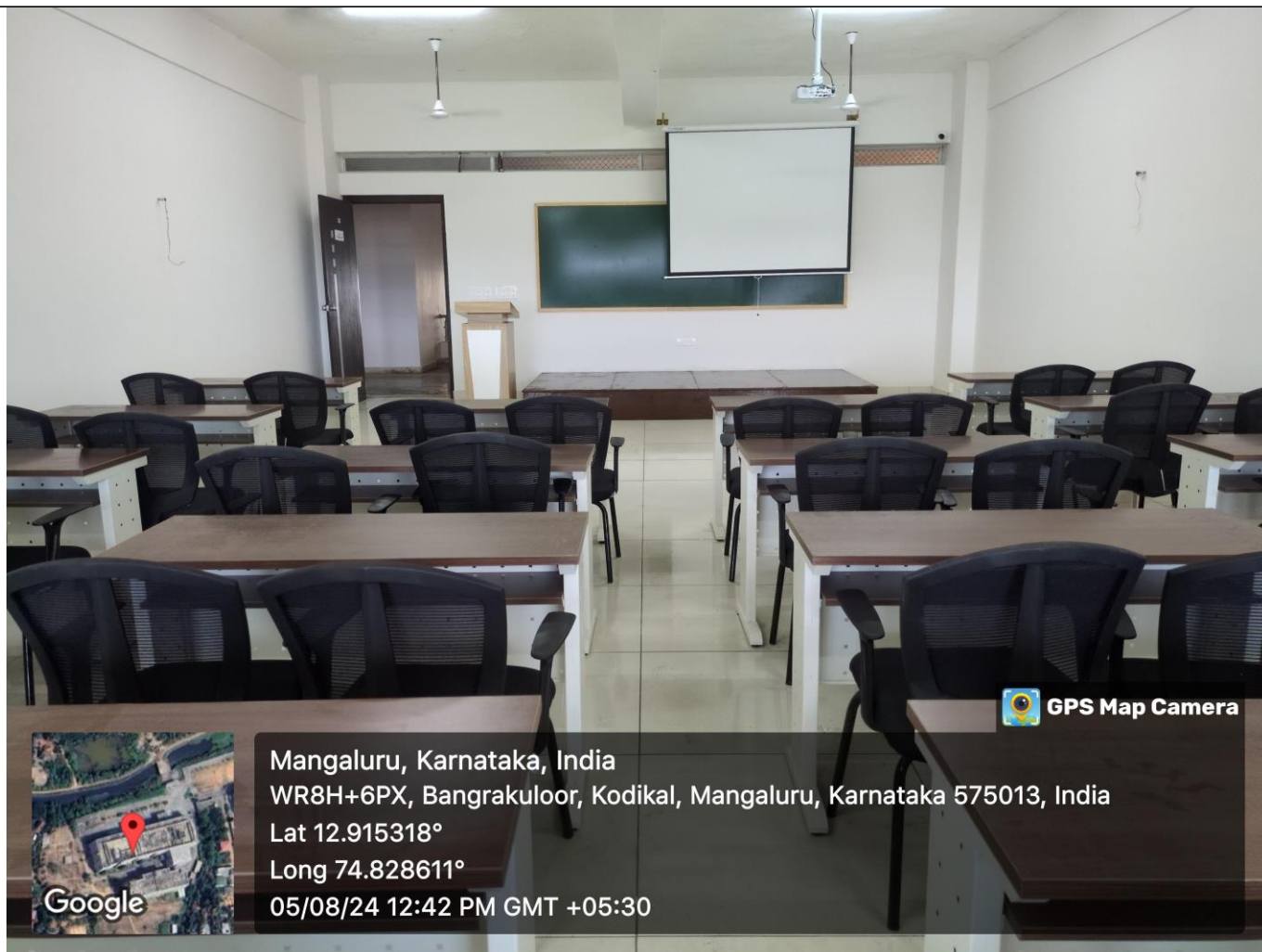
A-404: Inner View

Accredited by NBA (BE: CV, CSE, ECE, ISE, ME)